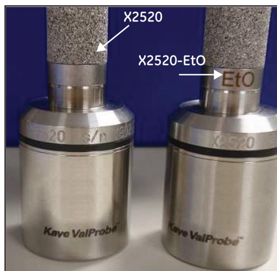
Figure 3: Loggers with and without ETO on Cap

The ValProbe loggers can be distinguished externally by the marking on the ValProbe cap. All the loggers shipping from the factory from 1 Mar 2010 have this marking. The loggers with ETO on the cap (Figure 3 below) include the EMD3000 sensors. Users should not interchange these caps with loggers having the EMD4000 sensors.