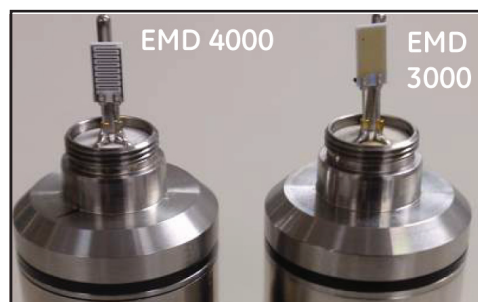
Figure 2: EMD3000 and EMD 4000 Sensors on Loggers

The ValProbe loggers can be distinguished externally by the marking on the ValProbe cap. All the loggers shipping from the factory from 1 Mar 2010 have this marking. The loggers with ETO on the cap (Figure 3 below) include the EMD3000 sensors. Users should not interchange these caps with loggers having the EMD4000 sensors.